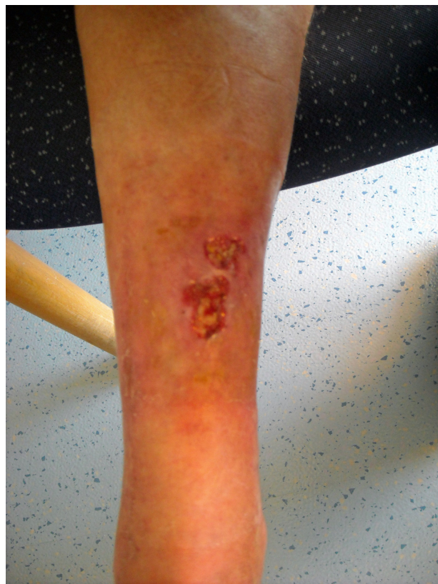
Figure 3 Leg lesion upon admission.

have a half-life beyond 3 hours. Provided that the elimination mechanism is nonsaturable, drug elimination should have been completed after 12–16 hours. In the underlying case, the local depot/excessive drug amount in the body, however, did induce hemodynamic effects well beyond this time period. The most critical period was the first 8 hours following inadvertent administration of an overdose 1000 times above the therapeutic level. The circumstance that circulation could still be stabilized indicates that the maximum effect(s) of treprostinil seem to be limited by a ceiling effect due to exhaustion of receptor reserve or to receptor downregulation. Interestingly, after 18 hours the pulmonary circulation did require restart of PAH specific treatment while peripheral circulation still required vasopressor support. However, in this context, a distinction between low blood pressure due to lack of peripheral resistance and myocardial insufficiency is hard to make since norepinephrine influences the myocardium via the \beta_1 pathway and peripheral resistance vessels via \alpha_1 receptors. Based on the speed of the clinical improvement, the elimination of treprostinil does not seem to be saturable.