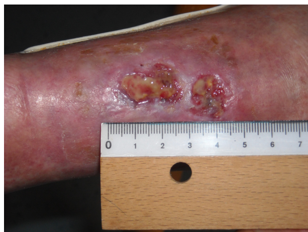
Figure 2 Lesions upon admission.

strongly guided procedure, to date there are very few overdose reports available. The current case, in terms of the actually administered dose, was entirely unprecedented. Hemodynamic stabilization following inadvertent excessive treprostinil overdose may be done with vasopressors such as norepinephrine and terlipressin. The respective dosages required are very high and even above the range used for hemodynamic management of sepsis. 9,10 Treprostinil does