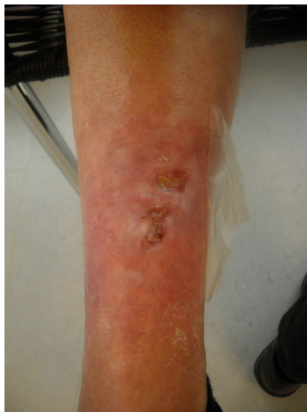
Figure 4 Leg lesion upon follow up.

strongly guided procedure, to date there are very few overdose reports available. The current case, in terms of the actually administered dose, was entirely unprecedented. Hemodynamic stabilization following inadvertent excessive treprostinil overdose may be done with vasopressors such as norepinephrine and terlipressin. The respective dosages required are very high and even above the range used for hemodynamic management of sepsis. 9,10 Treprostinil does