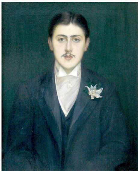
Fig. 4 Marcel Proust, a painting by Jacques-Émile Blanche from 1892

In 1912, 12 years after the erection of the Lavoisier monument, Marcel Proust finished his work on Du côté de chez Swann (Swann’s Way), the first volume of his novel À la recherche du temps perdu (In Search of Lost Time, the English translation is also known by the title of Scott Moncrieff’s first translation, Remembrance of Things Past ). However, the book failed to arouse the interest of publishers, and in 1913, Proust had to fund the publication himself [54]. However, the second volume of the novel, which was published after the First World War in 1919, was awarded the prestigious literary prize The Prix Goncourt. A total of seven volumes of the novel were published in 1927, the last three of them posthumously (Fig. 5).