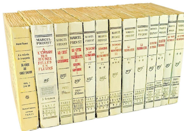
Fig. 5 The first edition of À la recherche du temps perdu (In Search of Lost Time) from 1913–1927 covers more than 3400 pages

In his novel, Marcel Proust immerses his hero, the Narrator, in the universe of his childhood memories and reflections on the experiences of adult life, taking the reader to the world of the highest social circles in France at the turn of the nineteenth and twentieth centuries, the so-called Belle Époque. According to Carter [55], during his lifetime, Proust witnessed the transition from the horse-and-buggy world without electricity and central heating, without high-speed transport and mass communications, to a world of aviation, Cubism, modern fashion, comfort, and hygiene. The plot of the novel, with more than 200 characters, unfolds against the backdrop of these dramatic changes. In Search of Lost Time is characterized by a masterful style, is written in highly cultivated language, and is an exceptional reading experience. And as Thiher [56] points out, the book is “a far-reaching attempt to reconcile the scientific worldview with the artistic possibility of vouchsafing poetic value to the individual life.”