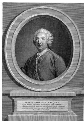
Fig. 2 The influential French chemist Pierre-Joseph Macquer (1718–1784), “ in horto regio chymiae professor a rege designatus et nominatus ” (in the royal garden—the famous Jardin du Roy—professor of chemistry designated and appointed by the king), and the extract on period rank of chemistry from the first edition of his famous Dictionnaire de chymie, contenant la théorie et la pratique de cette science (Paris 1766), shortened translation in text

Nous avons l'avantage de voir enfin les plus beaux jours de la Chymie. Le goût de notre siècle pour les matieres philosophiques, la glorieuse protection des Princes, le zele d'une multitude d'amateurs illustres & éclairés, le profond faveur & l'ardeur de nos Chymistes modernes, que nous n'entreprenons pas de louer, parcequ'ils sont au dessus de nos éloges, tout semble nous promettre les plus grands & les plus brillans succès. Nous avons vu la Chymie naître de la nécessité, recevoir de la cupidité un accroissement lent & obscur: ce n'est qu'à la vraie Philosophie qu'il étoit réservé de la perfectionner.