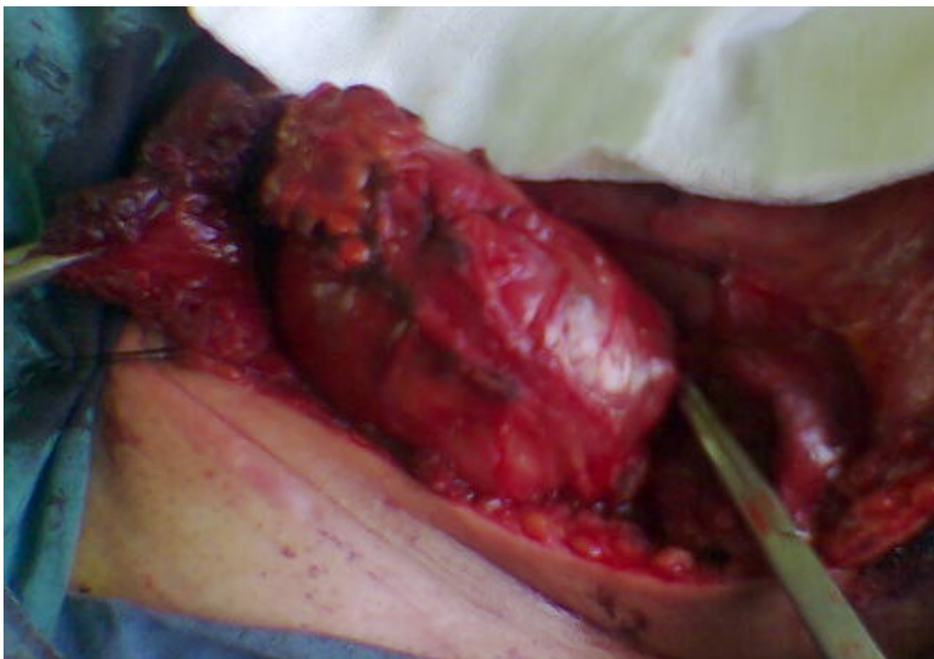
Figure 3 Radical resection of cervical mature teratoma.

focus, or growing of a mature teratoma. Late relapse may occur at any time. In a recent study from Memorial Sloan Kettering Cancer Center the medium time to relapse for 17 patients among 551 patients who had previously complete response to first line chemotherapy was 7.8 years [5]. In a recent analysis of 122 cases of late relapse medium time to relapse was 64.5 months in nonseminomatous germ cell tumours [12]. Lehman et al. reported a case of retroperitoneal mature teratoma 15 years after initial treatment of testicular germ cell tumor [13]. Late relapse was observed up to 32 years after initial treatment [7].