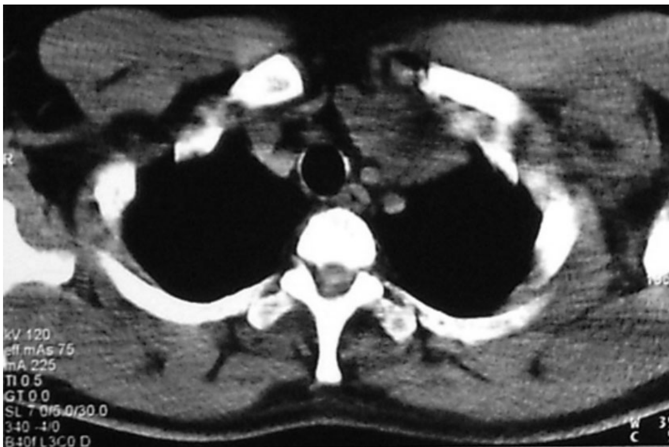
Figure 2 Computed tomography scan showing cervical mass with extension to anterior mediastinum in 2005.

Patient with bulky retroperitoneal disease and patient found to have teratoma following cisplatin-based chemotherapy appear to be at an increased risk of late relapse. Of 51 patients with mature teratoma in resected retroperitoneal residual tumor masses after chemotherapy, 9 patients (17.6%) relapsed. In five patients (9.8%) relapse resulted from growing mature teratoma [9].