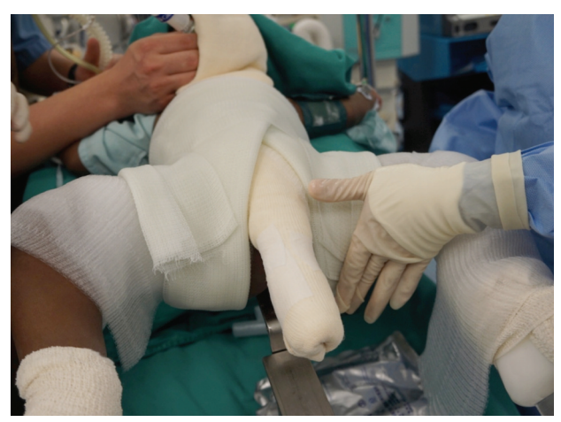
Fig. 2c: The long posterior slab (3rd slab) was applied superficial to the posterior ends of the first two slabs and wind around the body to end at the anterior aspect of the hips.

Skin irritation in the form of abrasion, pressure sore, and infection / infestation are common problems related to plaster cast application, especially for prolonged use. In a study on 297 patients with 300 hip spica cast for femur fractures, DiFazio et al <sup>8</sup> reported that 77 (28%) patients had skin complication. Among these patients, some required unscheduled cast change under anestehsia (31%), early cast bivalving (44%), or cast trimming (25%). We have one child (case 21) with abrasion over the inner thigh corresponding to the un-intentional edge inversion of the perineum opening. Since trimming of the edge might end up with sharp edge of fiberglass material, we decided to reapply the hip spica under anaesthesia. Subsequent recovery has been uneventful. Our results showed a relatively low rate of skin complications within our method of hip spica cast application.