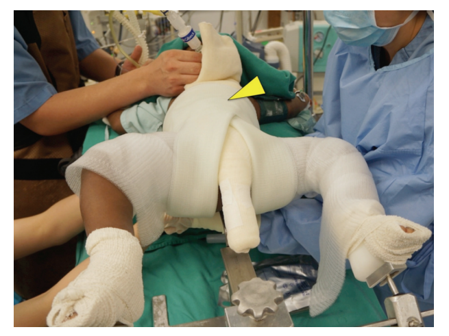
Fig. 2b: Anterior ends of the two slabs (1st and 2nd slabs) crossed the midline at the level indicated by the yellow arrow. Posterior ends were applied along the long axis of the trunk.

necessary. We decided to use fibreglass cast material due to its faster setting time, superior mechanical strength <sup>4,5</sup> and ability to retain 70% to 90% of initial strength upon contact with water <sup>6</sup>. Hybrid POP-fibreglass casts <sup>7</sup> have been recommended to improve the durability and reduce the cost. However, they were still heavier and not as strong as the fibreglass only cast. In addition, radiolucency of fibreglass material allows more accurate assessment of hip stability after cast application compared to POP only or hybrid casts. Our study showed that combination of the three-slab technique and use of fiberglass material could provide us with hip spica casts that were light, radiolucent and strong enough to withstand physiological loads for at least two months.