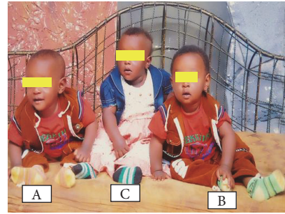
FIGURE 2: Picture showing the well-grown triplet infants at their 10 th months of life.

With the final diagnosis of full term + triplet pregnancy + mild anemia, she was prepared for elective C/S. Lower uterine segment transverse C/S done to effect the delivery of an alive triplet sets triplet A, male weighing 2800 g, triplet B, male weighing 3000 g, and triplet C, female weighing 3200g, all of them with APGAR score of 8/10 and 9/10 at first and fifth minutes of life. The first two triplets share the same placenta weighing 600g while the 3 rd female triplet has its own placenta weighing 480g but all of them having their own amniotic sac. (Figure 1). Following delivery of