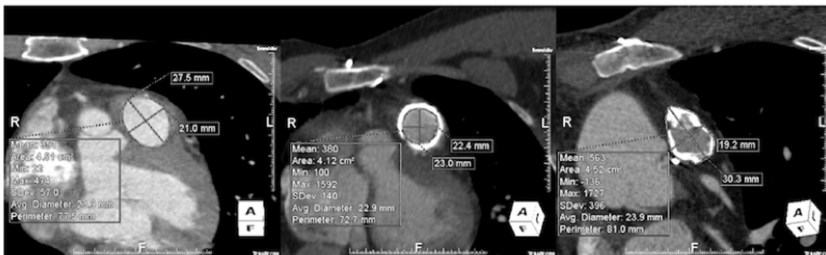
Fig. 2. Cross-sectional measurements of area, perimeter (circumference), long-axis ( D_{\max} ) and short-axis ( D_{\min} ) for patient with (a) native annulus (b) valve-in-valve and (c) conduit. Note for valve-in-valve case (b), the internal diameter of the existing bioprosthesis is measured. For the conduit case (c), the outer-outer dimension of the conduit, including calcifications, have been measured.