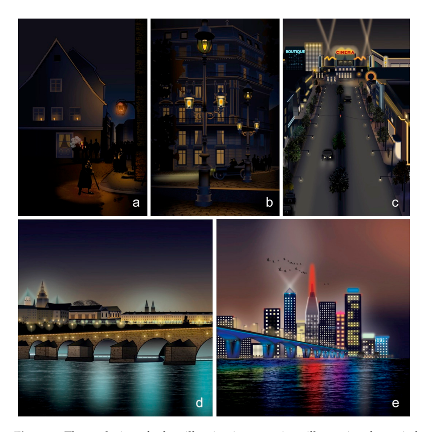
Figure 1. The evolution of urban illumination over time, illustrating the varied approaches of artificial lighting practice used to deliver illuminated night-time scenarios in built and natural landscapes. In the beginning, there were ( a ) relatively dark pedestrian pathways with dappled pools of light at street intersections and soupçons of light washing the first-floor façade of important buildings mainly used by citizens at night. Later, ( b ) robust iron poles with lanterns were applied to luster streets, roads, and paths. Then, ( c ) skyscrapers and tall buildings acquired illuminated elements for advertisement with vertically illuminated façades that reveal the structure of buildings. In the following years, ( d ) functional and decorative lighting co-existed in the same urban realm to make cities and towns functional and aesthetically pleasing at night. In recent years, ( e ) functional lighting for pedestrian and vehicular circulation and decorative lighting for skyscrapers, buildings, monuments, and landmarks have presented a changing luminosity and color condition with shifting shapes, patterns of shadow and light, along with videos projected onto buildings so they become illuminated canvases at night. Source: authors' own work.

Then, in addition to the horizontal illuminance parameters, artificial light was used as a medium on the vertical surface of tall buildings and skyscrapers to sculpt volumes for three-dimensional spaces. During the 20th century, multiple techniques emerged that included the uplighting of building façades as well as the use of searchlights, which are high-intensity electric sources of light used for finding objects in the distance at night. Searchlights were positioned to direct emissions of light towards the sky [55]. Furthermore, decorative advertising lighting systems were used to illuminate the top of buildings with marquee signs and letterings. Unfortunately, the position and direction of point sources used to illuminate the vertical plane directed light towards the sky. They also delivered higher illuminance parameters when compared with lighting systems used in previous years. Such light sources were present in illuminated parks, exposing the leaves of trees and plants to the emissions of light; as observed and reported in 1975, ALAN was considered to affect the flowering state in varied flowering plants [56].