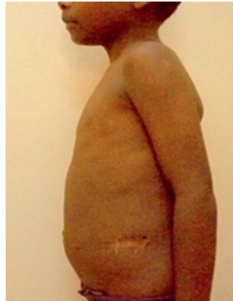
FIGURE 3: Postoperative picture at recent follow-up.

Giant hydronephrosis occupying the entire abdomen can mimic ascites to a great extent. Paracentesis in these cases could be detrimental causing pyelonephrosis, sepsis, and shock. Other cystic lesions like mesenteric, choledochal cysts (intraoperative cysts), renal adrenal, or pancreatic pseudocysts (retroperitoneal cysts) are the differential diagnosis. Each one of these entities could be differentiated by abdominal ultrasonography.