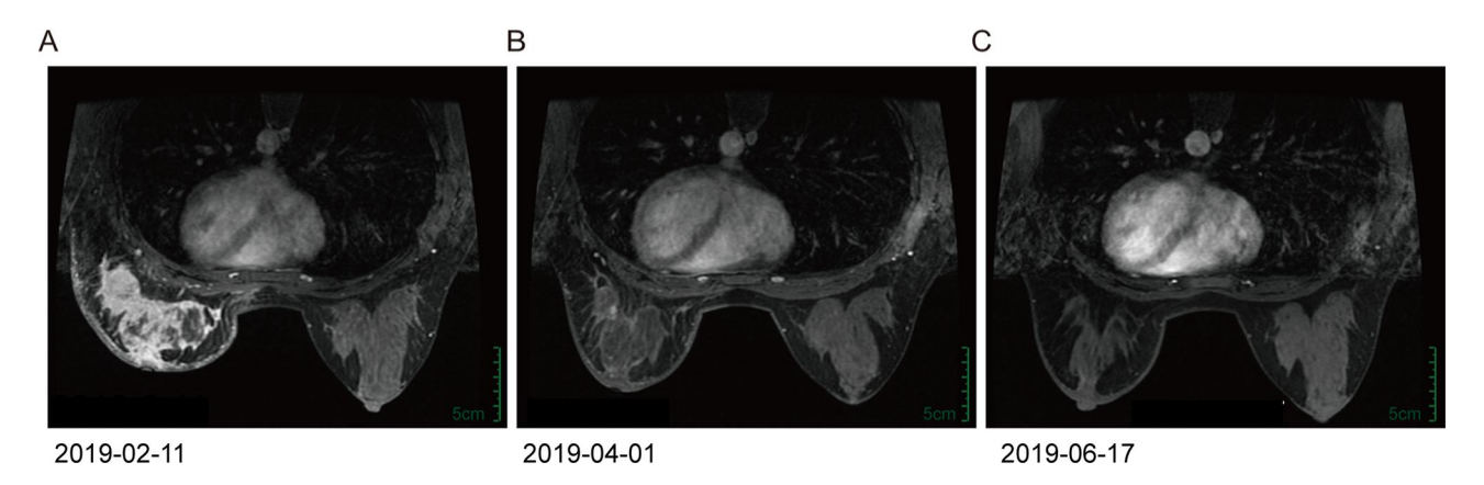
Figure 3 Breast MRI imaging. Notes: (A) MRI presents with a left breast mass (8.7cm in diameter) which was apparently intensified before treatment. (B) The imaging was scanned after 2-cycle treatment with PTPC (the combination of pyrotinib, trastuzumab, paclitaxel and cisplatin). It shows us a significant decrease in lesion size (0.7cm in diameter) and visibly reduced lymph node size in the left armpit, which was evaluated as a clinical partial response (cPR). (C) After 4-cycle treatment with PTPC, the imaging results were similar to those seen in the right breast on the imaging, suggesting a response close to a clinical complete response (cCR).