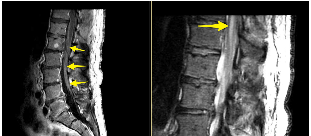
FIGURE 3: T1 post-contrast sagittal lumbar MRI showing cauda equina enhancement and T2 sagittal lumbar MRI showing conus medullaris edema.