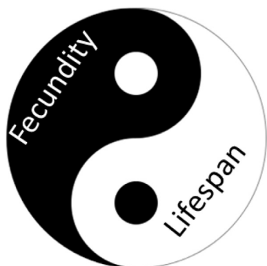
Figure 1 Interrelationship between lifespan and fecundity is depicted by the Taiji diagram. The fecundity increases as the lifespan shortens. Reversely, when the lifespan prolongs, the fecundity decreases.

Microorganisms and parasites are highly important in medicine. Except for some worms, the pathogens are generally tiny lives. Interestingly, although we have a better knowledge of how long a specific type of worm lives, we rarely think about the lifespan of bacteria and viruses. Nonetheless, the lifespan of these pathogens is critical for understanding their biological properties and the diseases they cause.