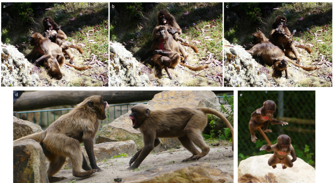
Figure 3. Social play in geladas. (a–c) sequences of an alloparental play fighting session involving an adult female and an immature subject (Amhara region, Ethiopia); (d) rapid facial mimicry of full play face between two subadult males at the NaturZoo (Rheine, Germany); (e) play running between two black infants at the NaturZoo (Rheine, Germany).

The findings on the possible roles of play fighting in geladas have been recently validated in the wild, although the study on natural populations provided a less clear-cut picture of the phenomenon [77]. The authors found that the competitive nature characterizing play fighting in this species can change according to the group membership of the players involved. Thanks to the video-analysis of 527 play fighting sessions, the authors were able to finely evaluate the asymmetry of the play patterns (Figure 3). Although play in wild geladas does not seem to suffer social canalization being equally distributed across age, sex and group membership, play sessions between subjects belonging to different OMUs are shorter, more unbalanced and less coordinated (less role-reversal and self-restraint, more competitive play) compared to those involving same-OMU players (more role-reversal, self-restraint and cooperation, more cooperative play). Hence, in geladas, play can be a tool for both reinforcing social bonds (intra-OMU play, captive and wild studies) and improving the physical skills necessary to cope with either future mates or competitors (inter-OMU play, wild studies). Thanks to the captive-wild synergic approach, it has been possible to unveil that the different behavioral coordination and cooperation of the players can be at the basis of the multifunction role of playful activity in this species.