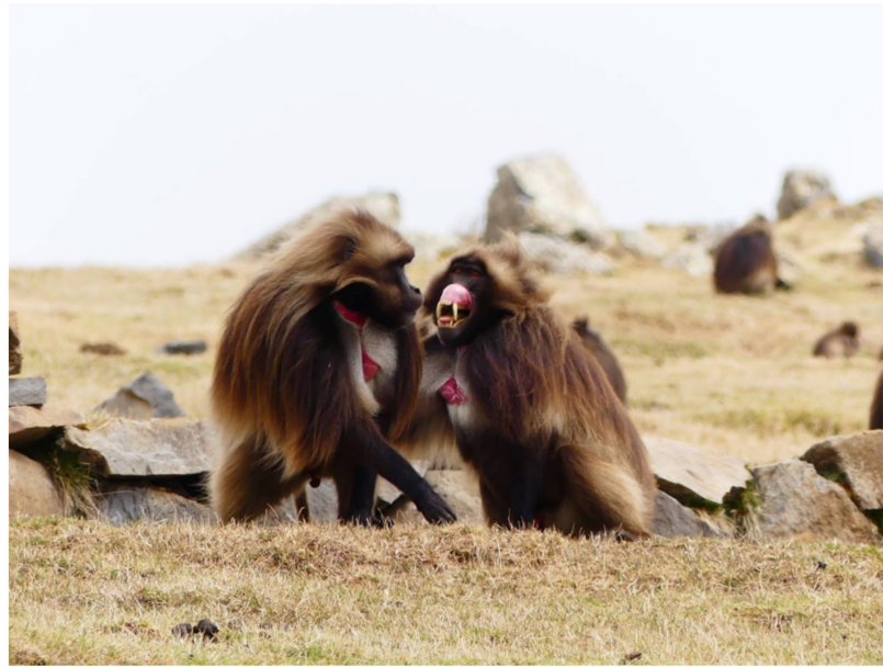
Figure 2. Post-conflict interaction between two adult males belonging to a bachelor group (Amhara region, Ethiopia). The subject on the right side is performing a lip-flip, a facial expression indicating benign intent.

To date, work with wild geladas has focused on the extent of social knowledge and understanding how geladas make social decisions when navigating their enormous societies. Different from other monkeys organized in multilevel societies containing about 150 individuals (e.g., Papio hamadryas ) [47], gelada communities may contain more than 1000 individuals [27,48]. Such large societies pose obvious challenges to the members as they are unlikely to have detailed information about each member of the community. Therefore, it can be difficult to know who might make an easy target for an attack, who is a potential mate, or who is a potential ally.