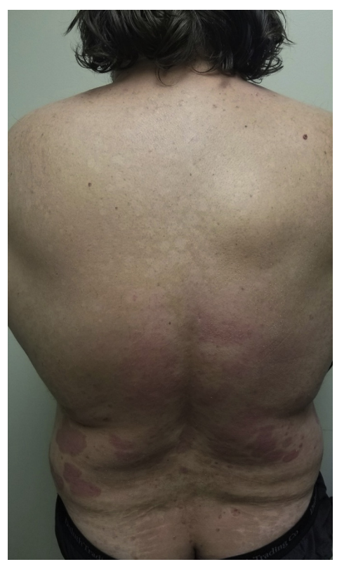
Fig 1. Hypopigmented scaly macules and patches extended from the shoulders to the lower mid back; similar hyperpigmented lesions extended from the lower back over the buttock. Psoriatic plaques persisted over the mid and lower back.