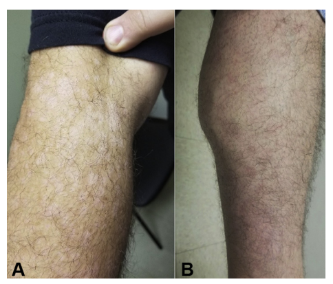
Fig 2. A, Diffuse hypopigmented scaly macules with minimal pinkness covered the right arm. B, Tan pinkish macules and small patches extended down to the distal left lower leg.

Ixekizumab, a humanized monoclonal IgG, binds to the IL-17 signaling molecule to prevent this molecule from binding to its receptor, thereby weakening the IL-17 immune response. IL-17 is normally responsible for stimulating and activating neutrophils; overactivation may contribute to the