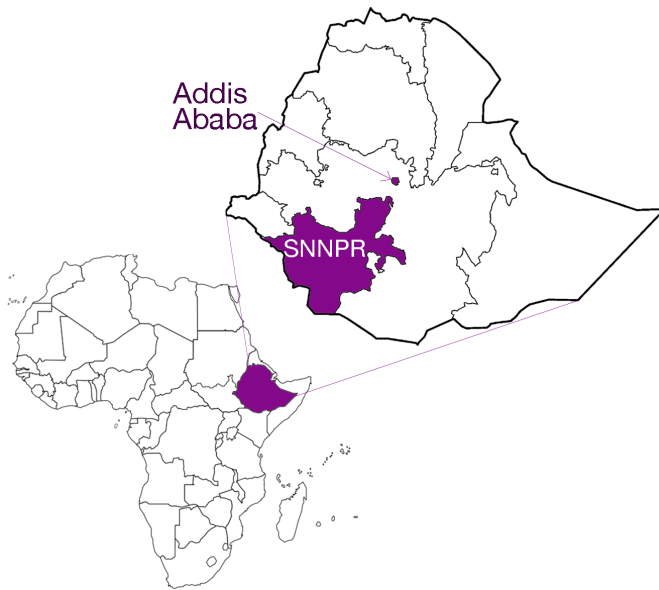
Figure 1 Map of the regions included in the birth registration study. SNNPR, Southern Nations, Nationalities, and People's Region.

and (nearly) universal. In poorer countries, many births are never registered. 3 Others are registered only several years after the birth, for example, when a birth certificate is needed to enrol in school. Within countries, the most disadvantaged social groups have lower registration rates than more affluent groups. 8–10