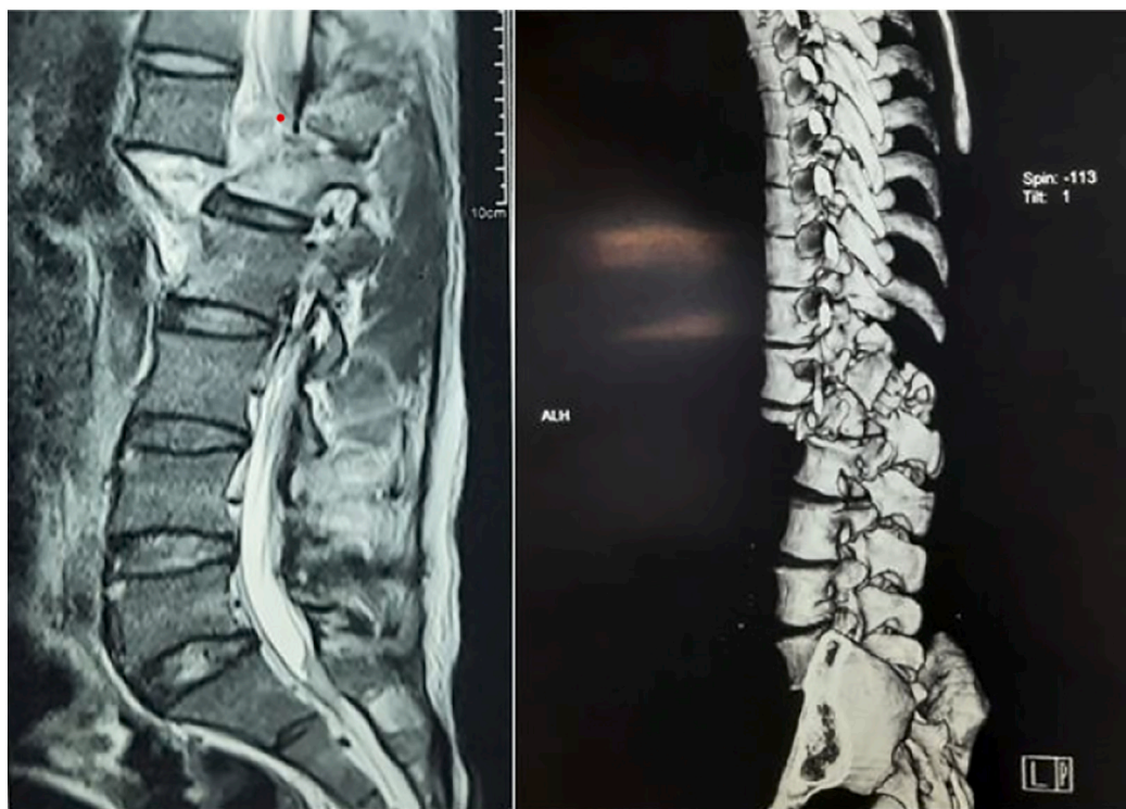
Fig. 1. T2-weighted magnetic resonance images and Three-dimensional computed tomography in the reconstruction view show traumatic spondyloptosis of T12/L1 with lower lumbar cord edema/contusion, conus medullaris, and upper cauda equina compression.

Intra-abdominal access, Posterolateral thoracotomy, and combined thoracoabdominal incisions are used to repair the Diaphragmatic hernia [8]. Laparotomy incision was used in this case because of the suspicion of other intraabdominal injuries, early surgery, and familiarity with the surgeon. Posterolateral thoracotomy warrants a good exposure for