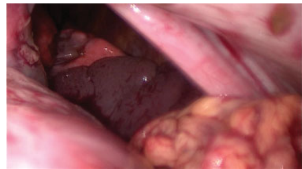
Fig. 4 Diagnostic laparoscopy: herniation of stomach, spleen, and bowel into the chest.

was found in the thorax and abdomen. After repositioning of the herniated organs into the abdomen, a gastric perforation at the lesser curvature was detected (→ Fig. 5), explaining the pneumothorax. The surgeon felt that the gastric perforation could not be closed safely laparoscopically; therefore, a conversion to laparotomy was performed with closure of the gastric perforation and repair of the CDH with interrupted stitches. After extubation on the fourth postoperative day, a retrovesical abscess was drained 30 days after the surgery. Due to a