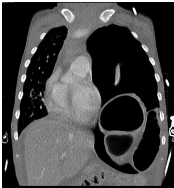
Fig. 2 Thoracic CT scan on admission. Left-sided tension pneumothorax with mediastinal shift. No further signs of a traumatic etiology. CT, computed tomography.

On admission, he showed severe dyspnea, a temperature of 39.5°C and tachycardia of 200/min. After immediate endotracheal intubation, a thoracic computed tomography (CT) scan was performed, which confirmed a left-sided enterothorax with mediastinal shift (→ Fig. 2). A left-sided chest tube was inserted, which drained a fluid that was initially considered to be old blood. Due to the sudden onset of symptoms and a normal chest X-ray which was available from the age of 1 year (→ Fig. 3), a diaphragmatic rupture was considered as a differential diagnosis. The boy was therefore taken to the operation room (OR) immediately. On diagnostic laparoscopy, a left-sided Bochdalek hernia was detected with herniation of the small intestine, spleen, and stomach into the chest (→ Fig. 4). Bile-stained fluid