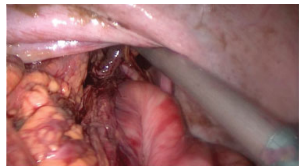
Fig. 5 Gastric perforation after repositioning of herniated organs into the abdomen.

was found in the thorax and abdomen. After repositioning of the herniated organs into the abdomen, a gastric perforation at the lesser curvature was detected (→ Fig. 5), explaining the pneumothorax. The surgeon felt that the gastric perforation could not be closed safely laparoscopically; therefore, a conversion to laparotomy was performed with closure of the gastric perforation and repair of the CDH with interrupted stitches. After extubation on the fourth postoperative day, a retrovesical abscess was drained 30 days after the surgery. Due to a