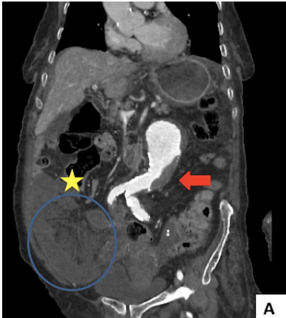
FIGURE 1: Coronal (A) CT scans demonstrating strangulated small-bowel loops in a “sac-like” formation (blue circle), shifting the ascending colon (yellow star) upward and thrombosed abdominal aorta aneurysm (red arrow).