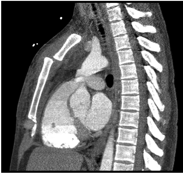
Fig. 1 Contrast-enhanced computed tomography sagittal image demonstrates manubrial-sternal dislocation.

Recently, the use of rigid metal plate fixation in sternal dehiscence and mediastinitis after cardiac surgery has been proposed with promising results. 5) This technique can be used safely and effectively in poststernotomy patients as prophylaxis against the development of sternal dehiscence and/or mediastinitis in high-risk patients with obesity, severe osteoporosis, chronic obstructive pulmonary disease, and immunocompromised state. 6) The aim of this study was to evaluate the effectiveness of an early surgical reconstruction of a displaced sternal fracture utilizing longitudinal rigid polymer fixation in the settings of an acute chest trauma.