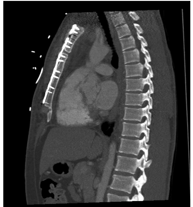
Fig. 2 Postoperative contrast-enhanced computed tomography sagittal image after surgical reconstruction.

On examination, pulse oximetry revealed an oxygen saturation of 94% on room air. The sternum was painful