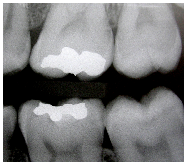
Figure 2. Radiographic aspect of tooth 37 after one year, which showed no caries progression.