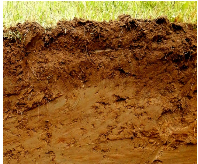
FIGURE 1 Soil profile of the investigated meadow, a Fluvisol