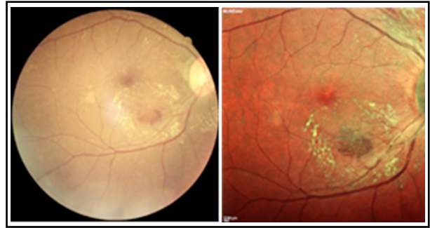
Fig.2: DR - retinal hemorrhage along with ERM appreciated more on multicolour OCT then CFP. (Hemorrhage shown by arrow).

and multicolor OCT. One (20%) eye had enhanced visualization of early disease on OCT multicolor in comparison to CFP, which was easily missed on CFP.