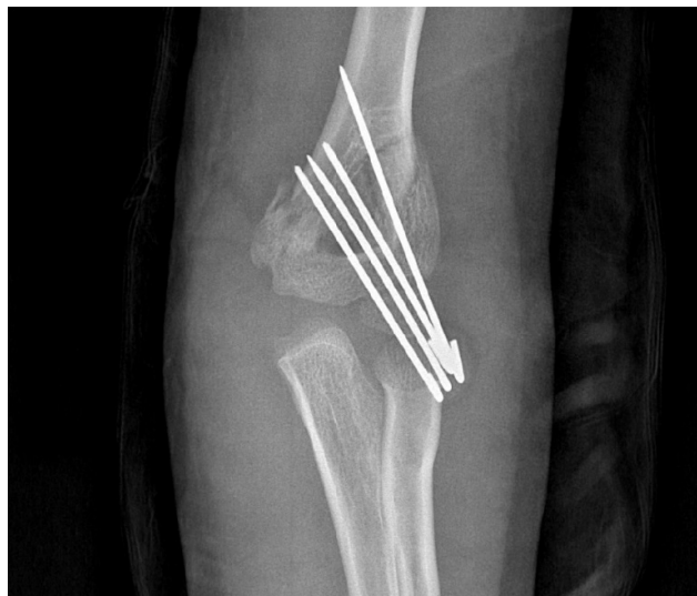
Figure 2 Examples of medial comminution and the lack of cortical contact on medial column in anteroposterior radiography.

angle in age, sex, body mass index (BMI), pin number, pin separation at fracture site, and medial comminution. Values are presented as the mean \pm SD, and the level of significance was defined at P < 0.05 .