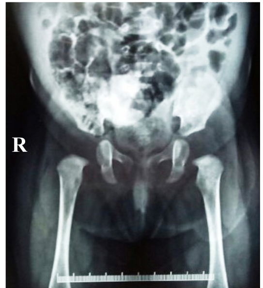
Figure 2 Cystogram (radiograph of the bladder with contrast, not properly visualized as not holding the contrast). R, right.

Rare variants of bladder exstrophy are pseudo-exstrophy, covered exstrophy, duplicate exstrophy, superior vesical fissure, visceral sequestration, and omphalocele, exstrophy of the cloaca, imperforate anus, and spinal defects syndrome. They comprise 10% of all cases of the exstrophy–epispadias complex. 1 Here, we managed a 1-year-old male child who presented with a 2.5 cm diameter mucosal opening in the hypogastric region, draining urine through it. The child also had distal penile hypospadias with a stenotic meatus through which he passed urine. The prepuce was hooded, and there was no chordee. On inserting a small-caliber feeding tube through the stenotic meatus, it is visible through the hypogastric region defect. A low-lying umbilicus was present (figure 1A,B). Widening of the symphysis pubis both clinically and on an X-ray was present. There was a divergence of the rectus abdominis muscle. Both testes were in the scrotum. He was continent of urine. Blood investigations were normal, including