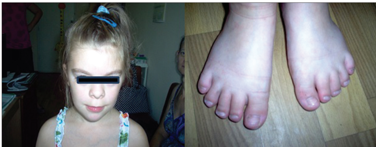
Figure 1. Phenotype of the proband.

Here, we report a girl with a 9655 Mb de novo deletion at 9q21.11-q21.2 presenting with mild intellectual disability, speech delay and characteristic facial features. Review of the literature showed that only 13 patients with a micro-deletion 9q21 have been reported [2,3]. The clinical symptoms observed in our patient are similar to those seen in the other patients with a deletion at 9q21.11-q21.2. In the cases described by Boudry-Labis et al. [2], they found mental retardation and speech delay in all patients, autistic behaviour, epilepsy and mild facial dysmorphism