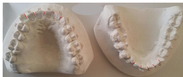
Figure 2. Assessment of Little’s irregularity index.

appliance allowed an 8.5° rotational play with an 0.014-inch archwire and thus caused less pain and discomfort compared to the conventional system with no play at the bracket slot. At the insertion of the second 0.016*0.025-inch archwire, the average lower incisor irregularity corrected on the Damon2 side of the archwire was lower than the conventional bracket side, which resulted in more pain experience with Damon2 self-ligating brackets. 21 In a split-mouth design, the dentition’s response to different bracket systems could be directly compared for each person, and the levels of discomfort could also be personally