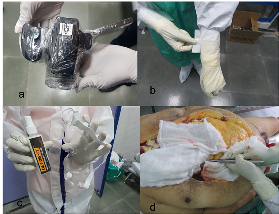
FIGURE 1: Modifications adopted during autopsy: (a) Wrapping of the camera with cling film to minimize contamination; (b) securing the outer gloves with micropore tape with its end folded for easy doffing; (c) spraying of antifogging spray to avoid fogging inside goggles; and (d) covering the surrounding areas around the cut to minimize aerosol transmission

The autopsies were conducted wearing full personal protective equipment (PPE) that included an N95 mask, caps, double gloves, shoe cover, gumboots, gown/overall, plastic apron, and goggles. The donning and doffing were done as per the recommended protocol [15]. Special care was taken especially during doffing to avoid contamination [16].