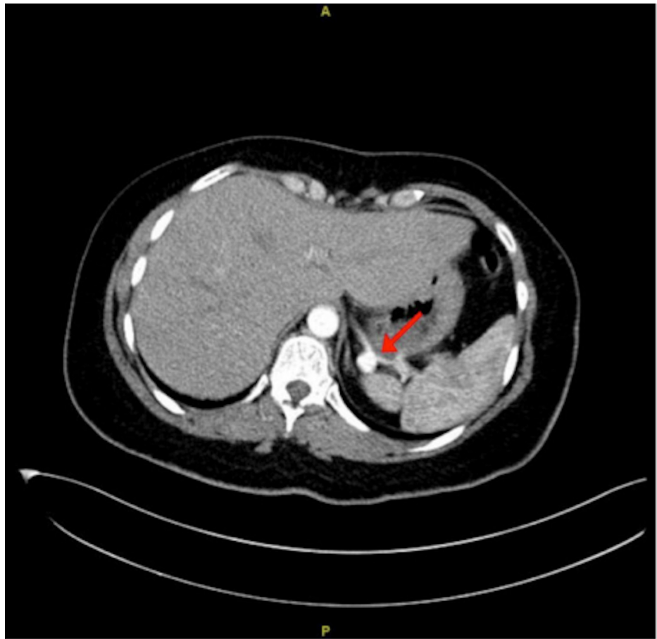
FIGURE 1: CT scan revealing an unruptured mid to distal splenic artery aneurysm