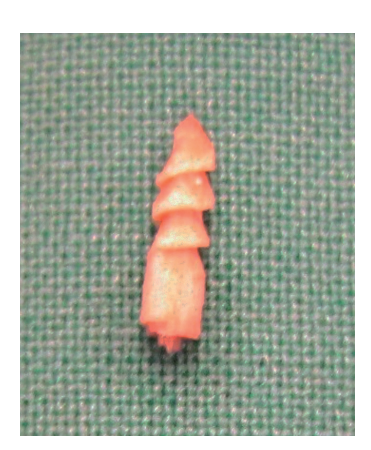
Figure 1. A POGLICO-SHS implant (birch screw).