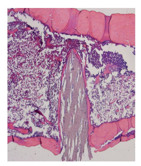
Figure 4. Histology of POGLICO-SHS-UNTR tibia (birch nail, no bisphosphonate). Note the layer of new bone covering the wood.

Fracture surgery has changed dramatically during the past decade, due to simple and somewhat boring practical and engineering improvements, such as angle-stable plates and soft tissue-sparing surgical techniques. Because these improvements were not suitable for publication in high-impact-factor journals, we need to use new, innovative, dynamic philosophies