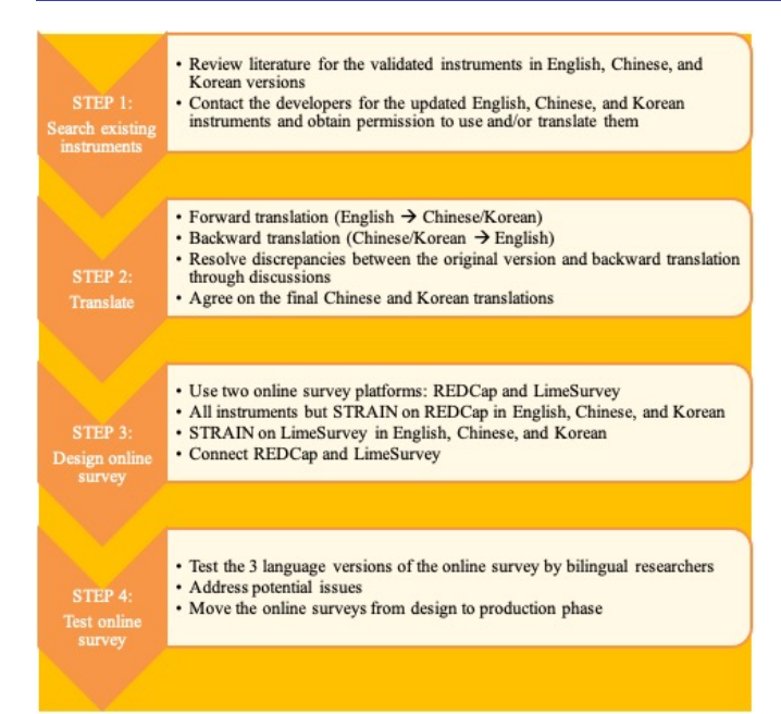
Figure 2 Multilingual survey development and testing process.