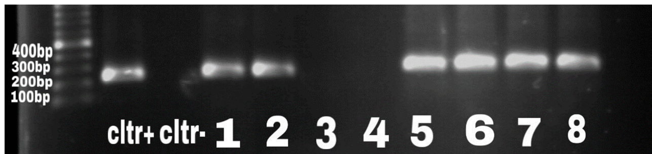
Figure 1 Gel electrophoresis for PA431C gene to determine the prevalence of P. aeruginosa . The band size was 232 bp. Samples 5–8 were positive, whereas 3 and 4 were negative clinical samples.

RUT was used to confirm H. pylori biochemically. We included the samples positive for both glmM PCR and RUT in our first group ( H. pylori positive). For the second group, we included only the samples that were negative for both RUT and glmM PCR.