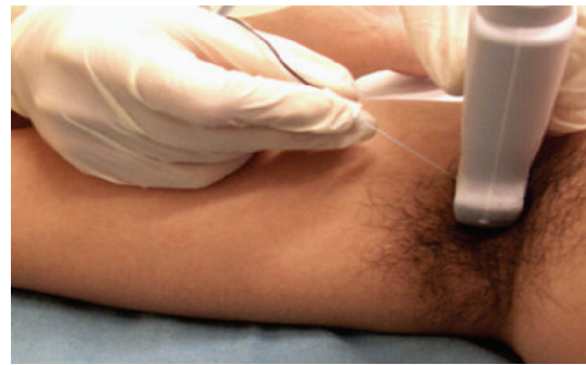
FIGURE 3: Ultrasound-guided axillary brachial plexus block. This is an example of an out-of-plane approach of the needle with respect to the probe.

o'clock position in relation to the artery. Injection of local anesthetic in a “horse-shoe” pattern underneath the artery, with the needle tip at 5 o'clock position, in our experience, effectively blocks the radial nerve in most cases. A similar “donut” technique has been described by Imasogie et al. [18], where the authors achieved successful block of the median, ulnar, and radial nerves by circumferential deposition of local anaesthetic around the axillary artery, instead of targeting them individually.