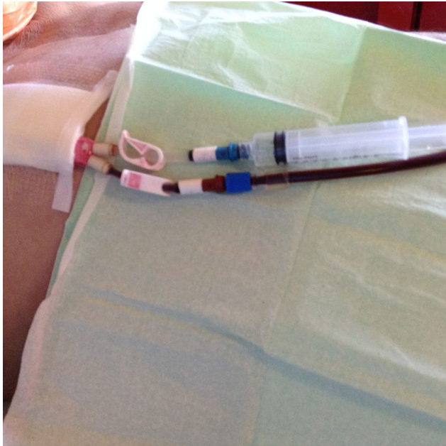
Figure S1 Usual care technique with direct access between tunneled CVC and the HD machine.

Abbreviations: CVC, catheter-related infection; HD, hemodialysis.