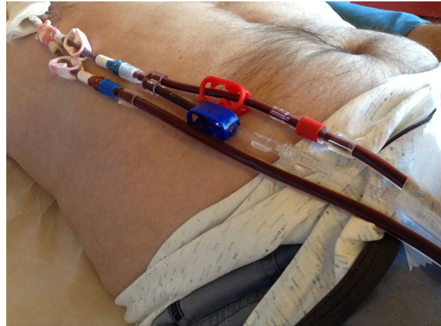
Figure S2 Y-connection technique (Gambro® sterile and non-pyrogenic circuit) between tunneled CVC and the HD machine.

Abbreviations: CVC, catheter-related infection; HD, hemodialysis.