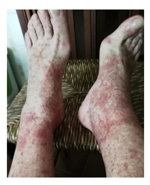
Figure 2. Purpuric manifestations in the legs after successful therapy with DAAs.