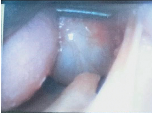
Figure 2: Videolaryngoscopic view showing the large cyst

not visualise the epiglottis because of the mass, but we could visualise a small area presumed to be the glottic opening through which bubbles were coming during the respiratory efforts of the child. We successfully intubated through this area, and a size 3.0-mm ID, uncuffed polyvinyl chloride (PVC) endotracheal tube was fixed to the left side of the angle of the mouth. Throughout this procedure, the patient was anaesthetised with oxygen and sevoflurane through the nasal airway on spontaneous ventilation. After confirming the tube position, inj. atracurium 0.5 mg i.v and inj. dexamethasone 1 mg i.v were given to prevent airway oedema. The anaesthesia was then maintained using oxygen, nitrous oxide mixture (50:50), and sevoflurane with controlled ventilation. The surgery was completed without any complications, and the cyst was removed in toto. The nasogastric (NG) tube was reintroduced for feeding. The child was electively ventilated for 48 h in anticipation of laryngomalacia,