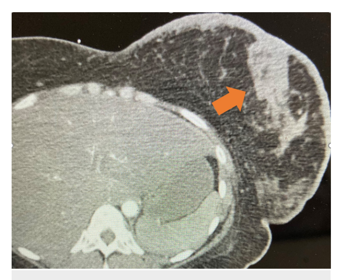
FIGURE 2: Computed tomography of the chest

An abnormal soft tissue density within the left breast was noted (orange arrow), along with additional abnormal skin thickening of the left breast.