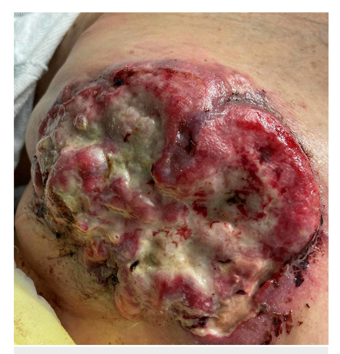
FIGURE 1: Imaging of a fungating left breast lesion with irregular margins and overlying necrotic and purulent

On exam, she was lethargic, tired, tachycardic to the 140s, tachypneic, febrile at 101° F, and hypoxic to 87% on room air, requiring oxygen via nasal cannula. The cardiovascular, pulmonary, and neurological examinations were grossly normal. The entire left breast was firm and had extensive skin thickening with a reddish discoloration. Overlying erythema, necrotic tissue, and foul-smelling purulent discharge were present (Figure 1). There was significant left axillary lymphadenopathy.