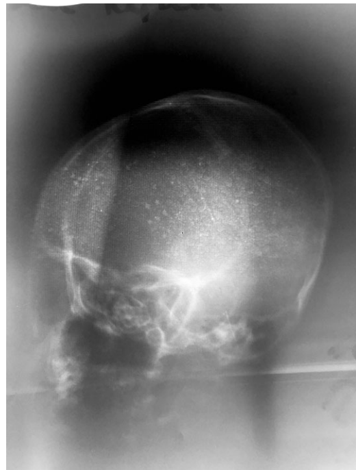
Figure 3: Lateral head X-ray. No other imaging modalities were available or functional at time of patient presentation.

blood count was notable for a hemoglobin of 11.3 g/dl and platelet count of 202 ( \times 10^6 u/ml).