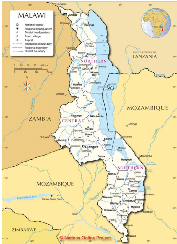
Figure 1: Map of Central Africa. Patients home location is approximately 150 miles from our tertiary hospital, the closest hospital with surgical capabilities.

point for eye opening as his eyelids were swollen shut; five points for best verbal response since he was able to converse appropriately; and five points for best motor response with localization of pain.