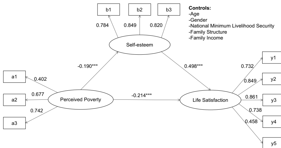
Figure 1 Model of interrelations between perceived poverty, self-esteem and life satisfaction. Note: *** p < 0.001 .

This study used SEM to analyse the effect of self-esteem on the relationship between perceived poverty and life satisfaction among impoverished college students. The findings indicated that perceived poverty had a significant negative influence on life satisfaction regardless of whether self-esteem was considered, but that self-esteem had a partly mediating function. As hypothesised, we found that self-esteem had a significant indirect effect on the relationship between perceived poverty and life satisfaction, reducing the influence of the former on the latter. Future studies should pay greater attention to the function of self-esteem in the relationship between perceived poverty and life satisfaction. Practical interventions for enhancing the poor's life satisfaction should recognise the role of a wider range of factors. Individual mindsets can be adjusted to reduce perceptions of poverty and boost self-esteem.