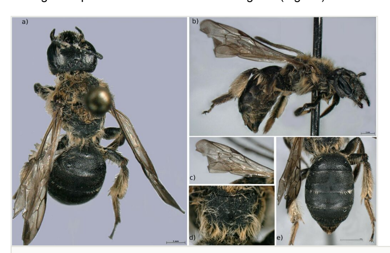
Figure 4. doi

Female: A medium size ground nesting bee with brownish hair and yellowish scopae (Fig. 4a and b). This species is characterised by having only 2 submarginal cells, despite being an Andrena (Fig. 4c). The middle part of the propodeum is coarsely wrinkled, clearly defined against the sides (Fig. 4d). The abdomen presents scarce, interrupted hair bands and densely punctured tergites, with very narrow spaces amongst the punctures on the surface of tergite 2 (Fig. 4e).