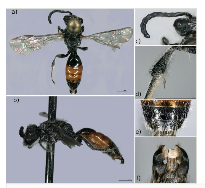
Figure 5. doi

Sphecodes majalis (Pérez, 1903) (Manternach, specimen MNHNL100057; BOLD identifier MNHNL163-21, one middle leg was used for DNA extraction). a. Dorsal view; b. Lateral view; c. Antenna, showing flagellar segments; d. Left hind tibia, showing spines in pale pubescence; e. Tergites 4 and 5; f. Genitalia. Background edited using GIMP 2.8.22 (The GIMP Development Team 2020).