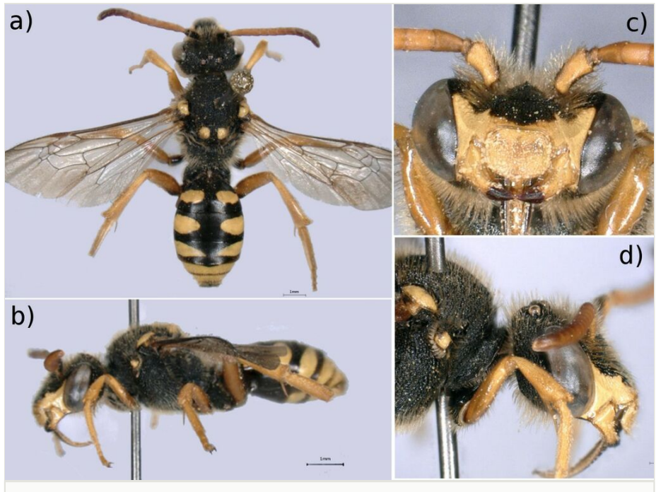
Figure 3. doi

labrum, the malar area, the para-ocular area and on the ventral surface of the scape (Fig. 3c). The malar area is characteristically long with a protruding lower face (Fig. 3d) and the labrum is rounded, without a tooth (Fig. 3e).