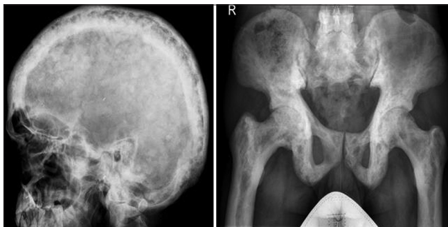
Figure 1: X-ray showing the sclerotic bony involvement of skull and pelvis in Paget's disease

PDB is a metabolic bone disease affecting bone remodeling, characterized by a high osteoclastic activity followed by compensatory increased osteoblastic activity. However, the new bone formation is in a disorganized mosaic fashion comprising woven and lamellar bone. This results in an expanded, less compact, more vascular fragile bone susceptible to fracture. [1] Paget's disease can occur in families, where it may