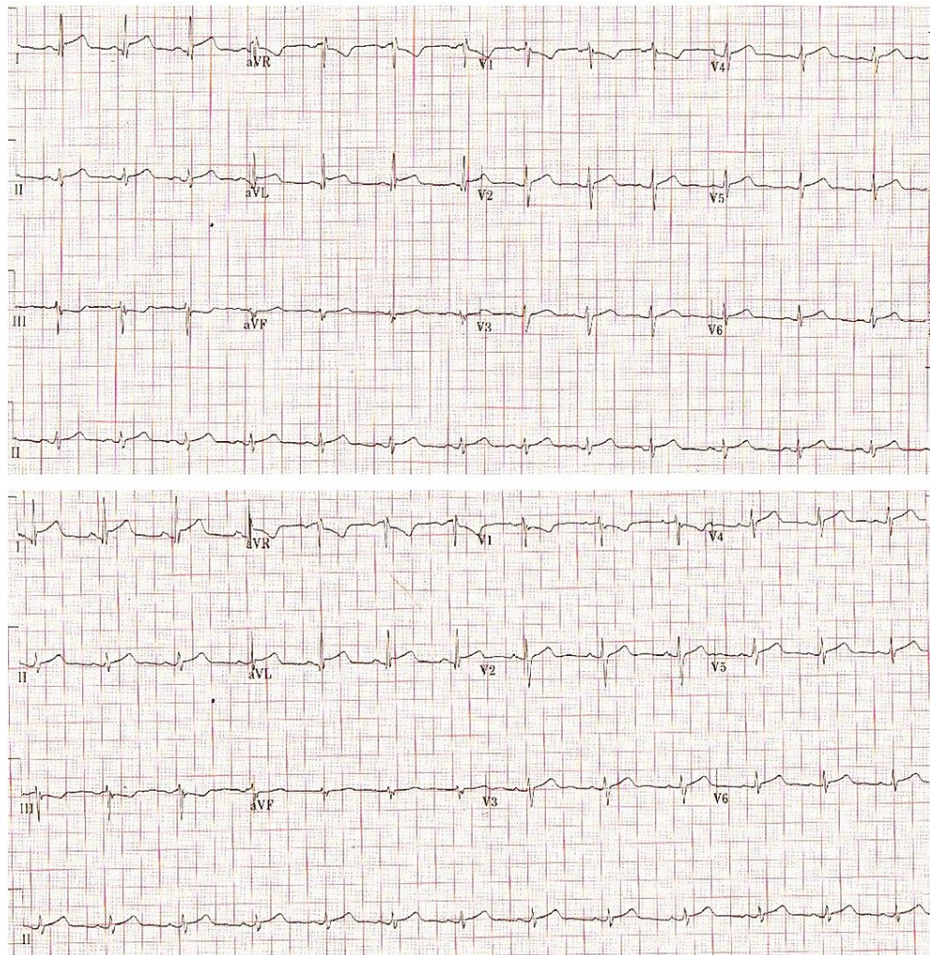
FIGURE 1: Electrocardiogram

HGB: Hemoglobin; WBC: White blood count; CK-MB: Creatine kinase-MB; BNP: Brain natriuretic peptide; TSH: Thyroid stimulating hormone; CPK: Creatine phosphokinase; CRP: C-reactive protein; T.bilirubin: Total bilirubin; ESR: Erythrocyte sedimentation rate; ALT: Alanine transaminase; AST: Aspartate transaminase; ALP: Alkaline phosphates.