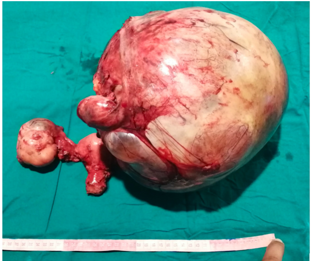
FIGURE 3: The gross morphology of the excised specimen.

The postoperative recovery was uneventful, and the patient was discharged on the fifth day postoperatively. The mass obtained from surgery was subsequently sent for histopathological evaluation. Gross examination revealed a tumour afflicting both the left and the right ovaries, measuring 21 x 21 x 13 cm and 8.5 x 6.0 x 5.5 cm, respectively. Additionally, both fallopian tubes were also positive for carcinoma. Histopathological workup further revealed a high-grade endometrioid ovarian carcinoma afflicting both the ovaries with concomitant serosal involvement and positive ascitic fluid. Sections obtained from both the ovarian masses showed a glandular configuration of a highly malignant tumour with a confluence of glands, papillary configurations, and areas of solid nests. A significant nuclear stratification, increased mitoses, apoptoses, and areas of necrosis and rare foci of squamous differentiation were also appreciated. Imperatively, no psammoma bodies were identified. Furthermore, lymph-vascular invasion was identified. Taken together, these histopathological findings insinuated an unequivocal diagnosis of a high-grade ovarian endometrioid carcinoma. Immunohistochemical staining was further performed with adequate controls.