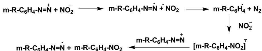
Scheme 2 The schematic of a radical mechanism adopted from Tetrahedron Lett. , 1982, 23, 5191.

Ref. 14 should also be updated to include more relevant literature reports of ipso -nitration (ref. 14d-h in the article, presented here as ref. 1a–e). In 1939, E. B. Starkey reported the replacement of an amine group by a nitro group through a diazotization reaction. 1a In 1947, Hodgson and co-workers reported the replacement of a diaxonium by a nitro group. 1b