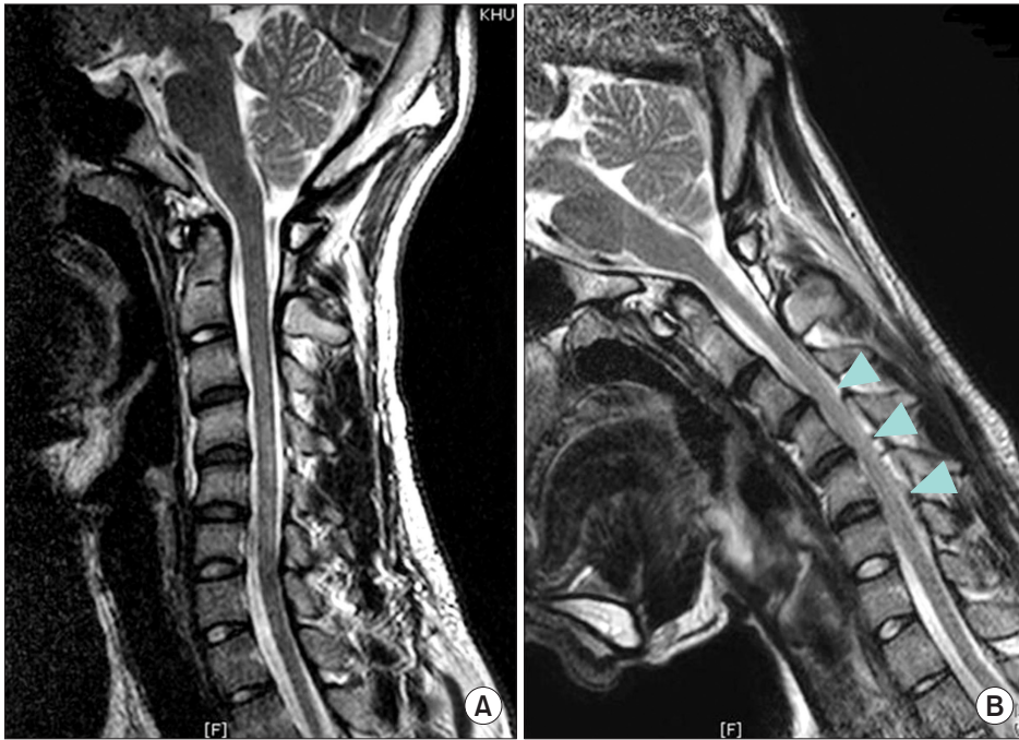
Fig. 2. (A) Midline sagittal T2-weighted magnetic resonance imaging of the cervical spine in the neutral position reveals normal contour and intramedullary high signal intensity along the fourth to sixth cervical vertebral levels without cervical cord compression. (B) On sagittal T2-weighted images in the flexed neck position, there is anterior shifting of posterior dural sac below the third cervical vertebral level, compressing the spinal cord from third to sixth cervical vertebral levels (arrow).