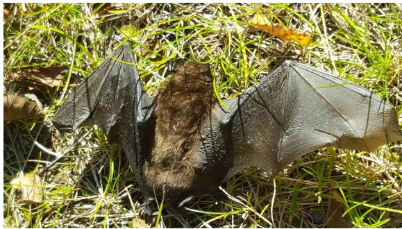
Fig. 1 The Daubenton's bat found dead in the municipality of Inkoö, SW Finland.

the bat. RNA was extracted from the organ and swab suspensions of the bat with the QIAamp Viral RNA Mini Kit (Qiagen, Hilden, Germany) according to the manufacturer's instructions. The OneStep RT-PCR kit (Qiagen) was used to amplify two fragments. The reaction volume was 25 µL and the temperature profile of cDNA synthesis and amplification was 30 min at 50 °C, 15 min at 94 °C for reverse transcriptase inactivation and DNA polymerase activation, followed by 30 amplification cycles of 1 min at 94 °C, 1 min at 50 °C, and 1 min at 72 °C. Primers were published by Davis et al. [16]. The results are presented in Table 1. After agarose gel electrophoresis, the band of the brain sample was cut from the gel and DNA was extracted with the Qiaquick Gel Extraction Kit (Qiagen). The reaction products were purified using the DyeEx 2.0 Spin Kit (Qiagen). PCR products were sequenced using an ABI 3100 Avant Genetic Analyzer (Applied Biosystems) with the primers used in the PCR and a Big Dye Terminator v3.1 Cycle sequencing kit (Applied Biosystems). The sequences were analyzed with DNASTAR Lasergene 10.