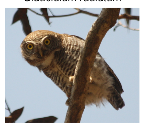
Fig 1. Co-distributed Indian owlets show plumage similarity, however can be identified based on size and markings on the chest and forehead. Presence of white spots and brown bars in case of A. brama and G. radiatum respectively are identification keys. Photo credits: color banded H. blewitti individual by PM, A. brama and G. radiatum by PK.

https://doi.org/10.1371/journal.pone.0192359.g001