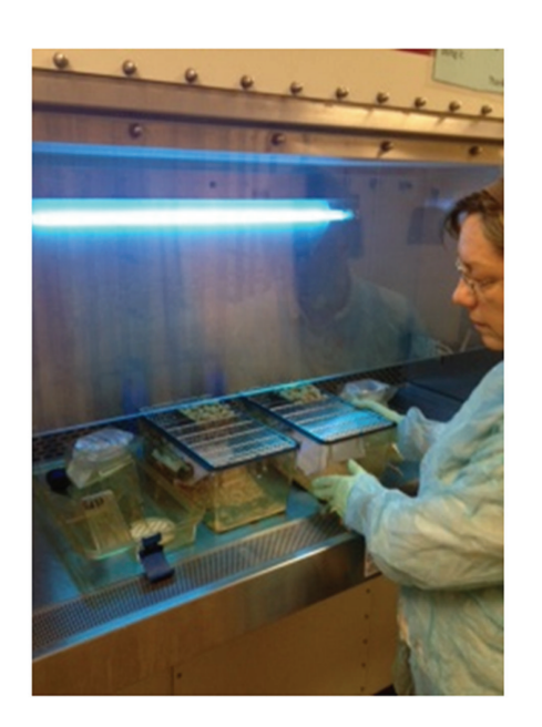
FIGURE 2: Practitioner setup for bioenergy intervention.

At the end of each treatment the practitioner would acknowledge the contribution of the mice, remove themselves from the mouse energy field, and leave the room. The researcher would return to the room, replace the water and plastic cover over each of the mice cages, and place the mice back in the same spot on the rack.