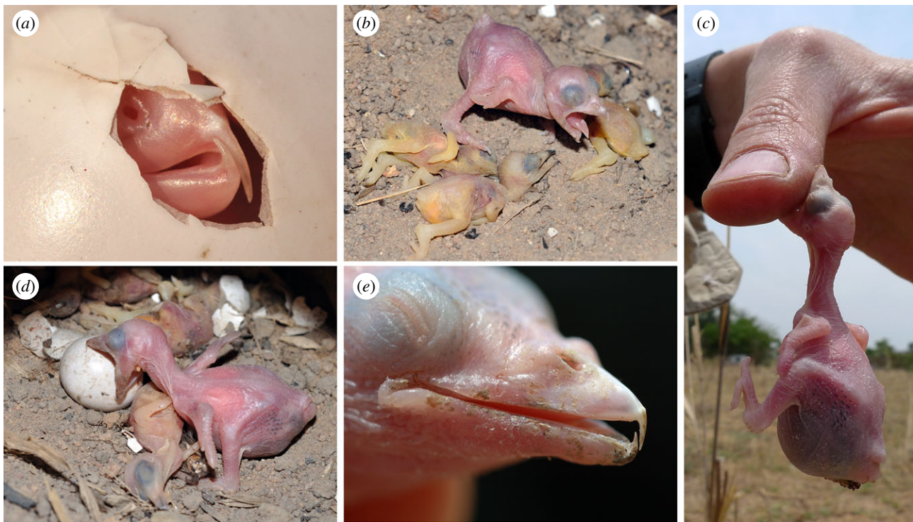
Figure 1. (a) Hatching lesser honeyguide, showing fully developed bill hooks; (b) greater honeyguide chick with three recently killed little bee-eater hatchlings; (c) biting human hand; (d) biting unhatched swallow-tailed bee-eater egg; (e) aged about 8 days. All photos are from different nests.

stage. Therefore, a parasitic egg was incubated by hosts in only 49 (28.5%) of all host nests. Honeyguide oviposition occurred any time from the start of host egg-laying to late into the host incubation period. Greater honeyguides did not remove host eggs, but (uniquely among honeyguides [6]) punctured them at the time of laying. Embryos in punctured eggs usually died [9], but sometimes remained viable. Moreover, host eggs were sometimes missed or laid subsequent to the honeyguide's visit. Thus, only 67 per cent ( n = 194 ) of host eggs in parasitised nests were punctured. In 30 of 55 parasitised nests (55%), at least one (range one to four) host egg was unpunctured and could have hatched; proportions were similar for other host species. Hence, egg puncturing only partially removed the scope for subsequent chick killing.