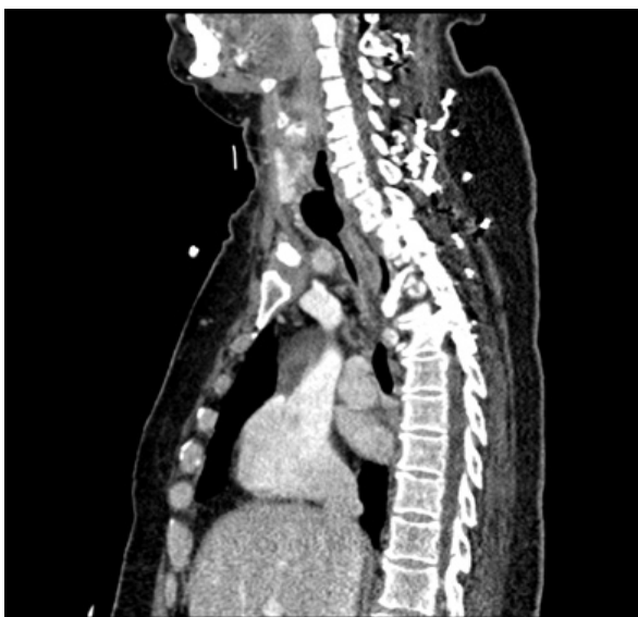
Figure 1 Computed tomography scan.