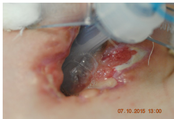
Figure 4 Before treatment.

Topline (Industrial Ltd, Stevenage Hertfordshire, UK) with multibeam laser probe with 18 diodes and radiation: red 685 nm/30–50 mW, infrared 830 nm/100–400 mW and combined until 1,800 mW. Treatment consisted of 9 sessions each lasting 2 minutes, focused on the wound area. Topical treatment included customized ointment composed of 85 g allantoin ointment 2 packages, panthenol spray 1/5 p, sol-coseryl dental 5 g, dexaven dental 5 g and metronidazole dental 5 g. It was a dose for 1 month treatment. Dressings were changed daily. Complementary treatment included Kinesiology taping (Nittodenko, Osaka Prefecture, Japan). Local treatment lasted 35 days with good results, and much improvement was observed during the course of the therapy. When the local effect was satisfactory and the wound almost completely healed, we discharged the patient out of the hospital and forwarded him to palliative care with home ventilator program. Local treatment with Kinesiology Taping and ointments was continued for next 4 months, with very good final – total wound healing and proper formal stoma and tracheocutaneous tract creation (Figures 4 and 5 present wound before and after the treatment).