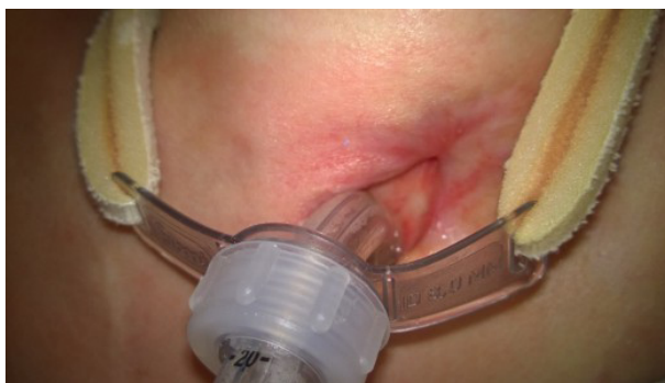
Figure 5 After local treatment.

Topline (Industrial Ltd, Stevenage Hertfordshire, UK) with multibeam laser probe with 18 diodes and radiation: red 685 nm/30–50 mW, infrared 830 nm/100–400 mW and combined until 1,800 mW. Treatment consisted of 9 sessions each lasting 2 minutes, focused on the wound area. Topical treatment included customized ointment composed of 85 g allantoin ointment 2 packages, panthenol spray 1/5 p, sol-coseryl dental 5 g, dexaven dental 5 g and metronidazole dental 5 g. It was a dose for 1 month treatment. Dressings were changed daily. Complementary treatment included Kinesiology taping (Nittodenko, Osaka Prefecture, Japan). Local treatment lasted 35 days with good results, and much improvement was observed during the course of the therapy. When the local effect was satisfactory and the wound almost completely healed, we discharged the patient out of the hospital and forwarded him to palliative care with home ventilator program. Local treatment with Kinesiology Taping and ointments was continued for next 4 months, with very good final – total wound healing and proper formal stoma and tracheocutaneous tract creation (Figures 4 and 5 present wound before and after the treatment).