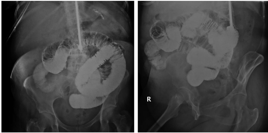
Figure 1: Small bowel follow-through with gastrograffin showing completed obstruction after 8 h in the mid-right lower mesogastric region.