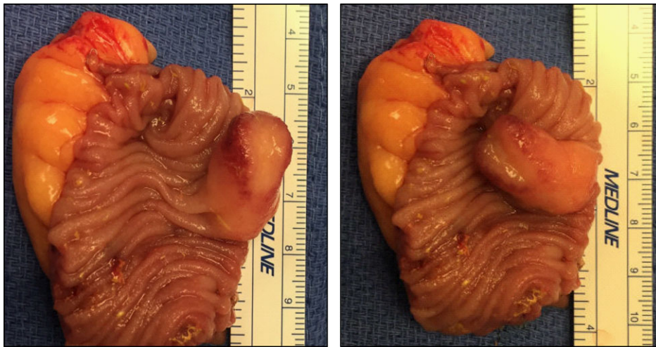
Figure 2: Resected small bowel with intraluminal lipoma.

characteristics of a lipoma (Fig. 2). Pathologic evaluation of the specimen showed a 1.5 \times 1 \times 1 \text{ cm}^3 submucosal lipoma with a small area of overlying ulceration and no evidence of malignancy (Fig. 3). The rest of her hospital course was complicated by a fascial dehiscence requiring retention suture placement. She was discharged on post-operative Day 18.