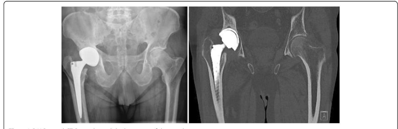
Fig. 1 A-P X-Ray and CT-Scans showed the loosening of the prosthesis